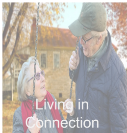
Living in Connection